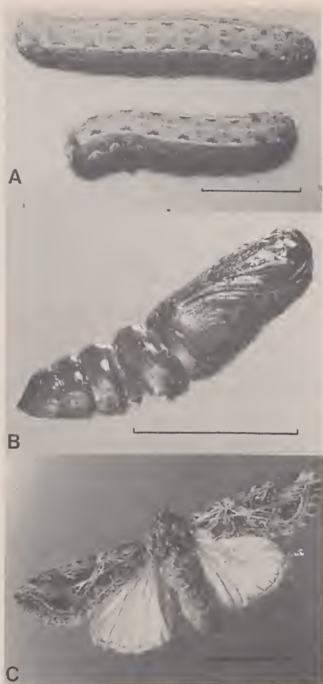
Fig. 1 — The Cluster Caterpillar Spodoptera litura (Fabricius): A larvae; B pupa; C emergent moth. Line scale = 1cm.